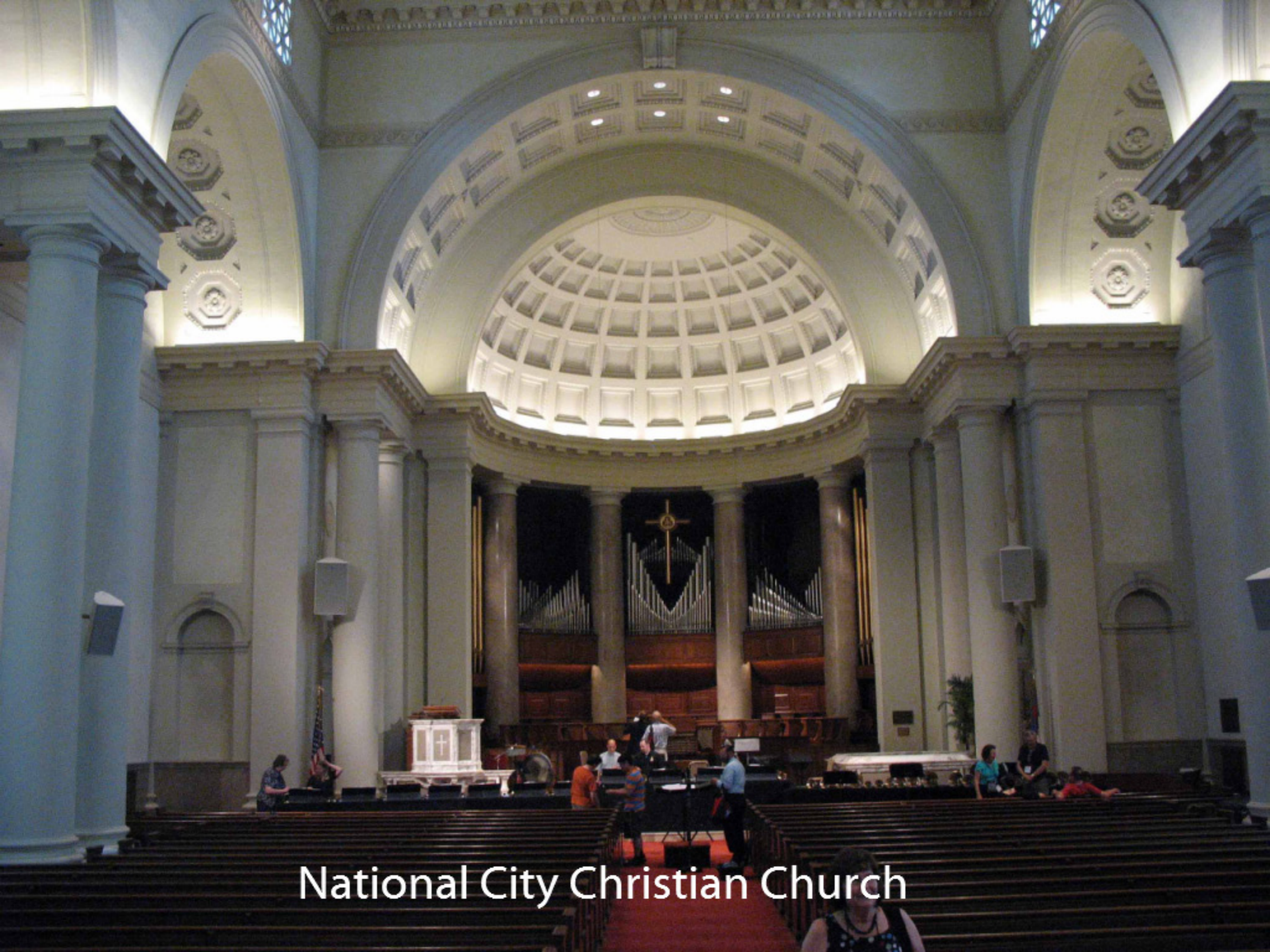
National City Christian Church