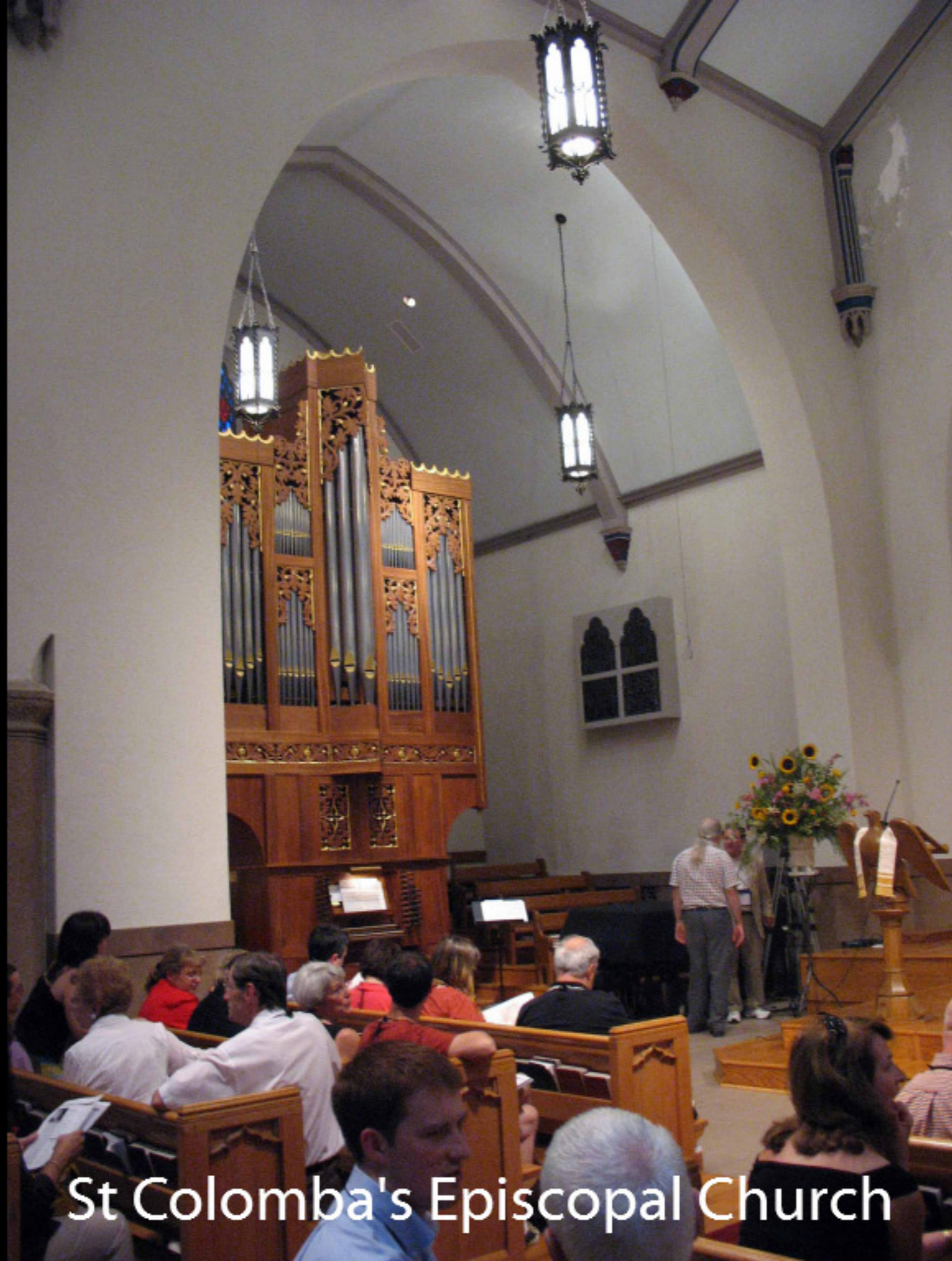
St Colomba's Episcopal Church