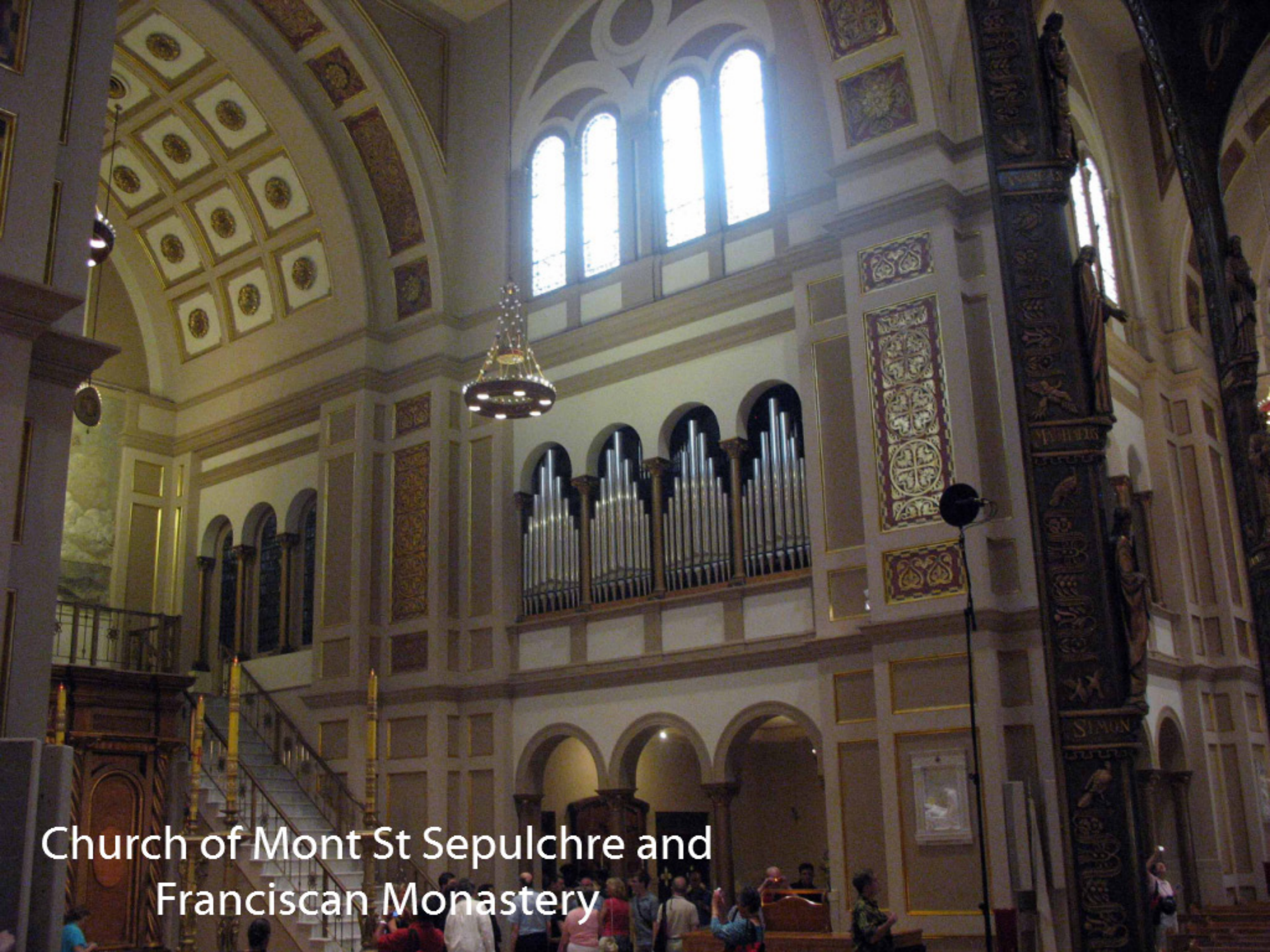
Church of Mont St Sepulchre and Franciscan Monastery