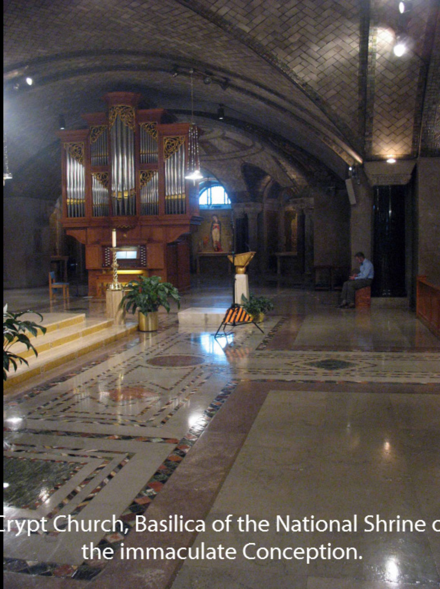
Crypt Church, Basilica of the National Shrine of the immaculate Conception.