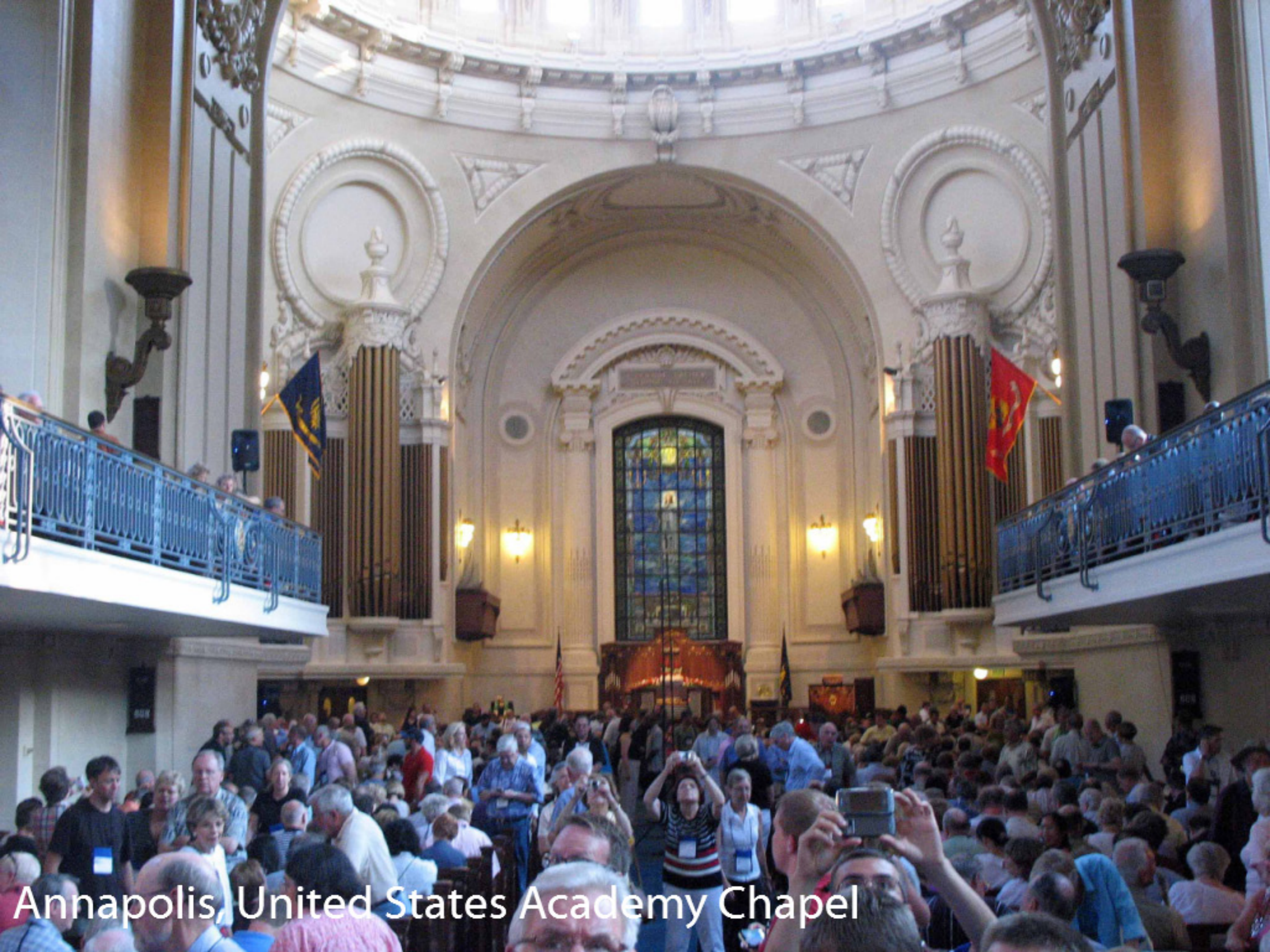
Annapolis, United States Academy Chapel