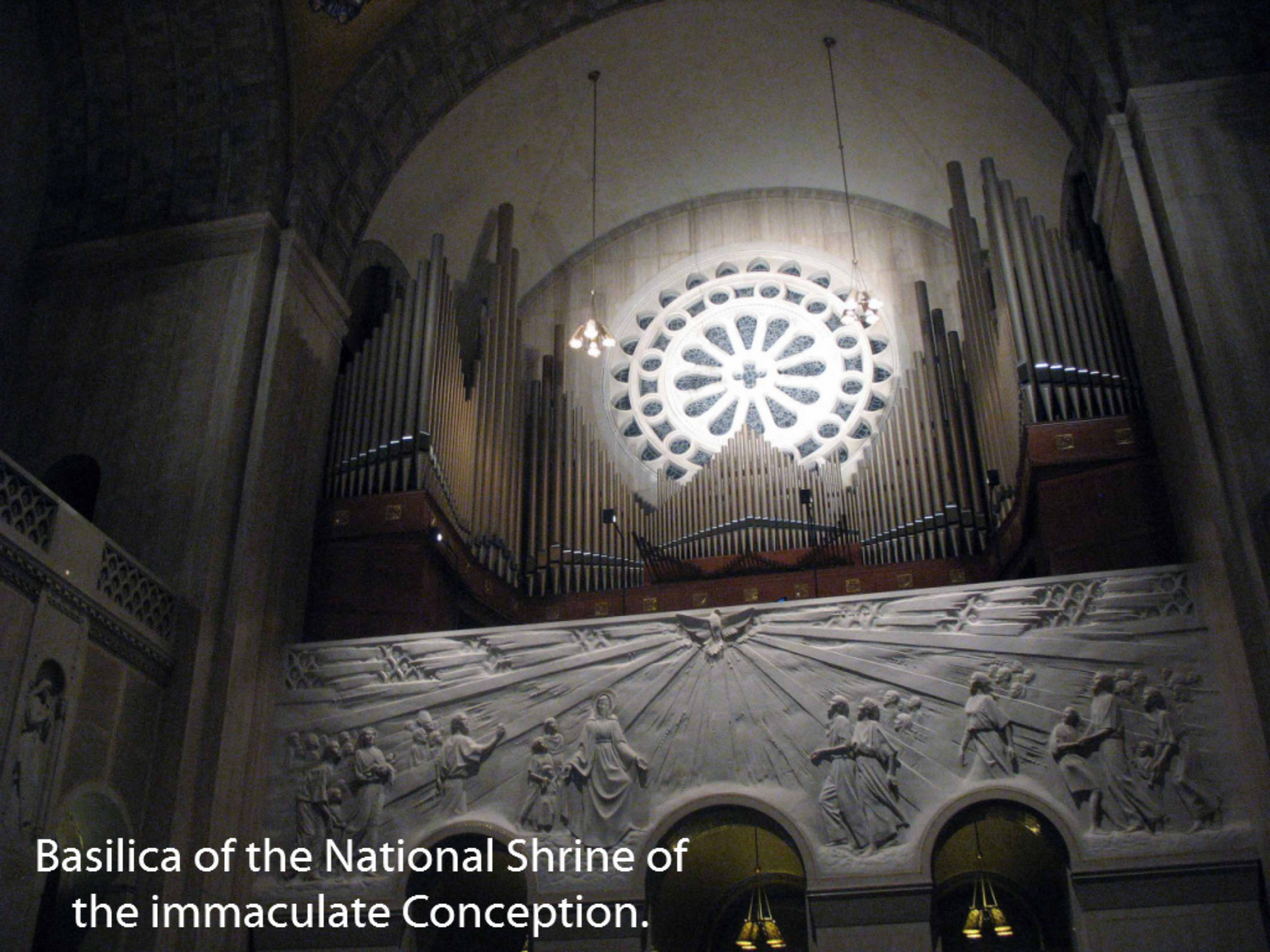
Basilica of the National Shrine of the immaculate Conception.