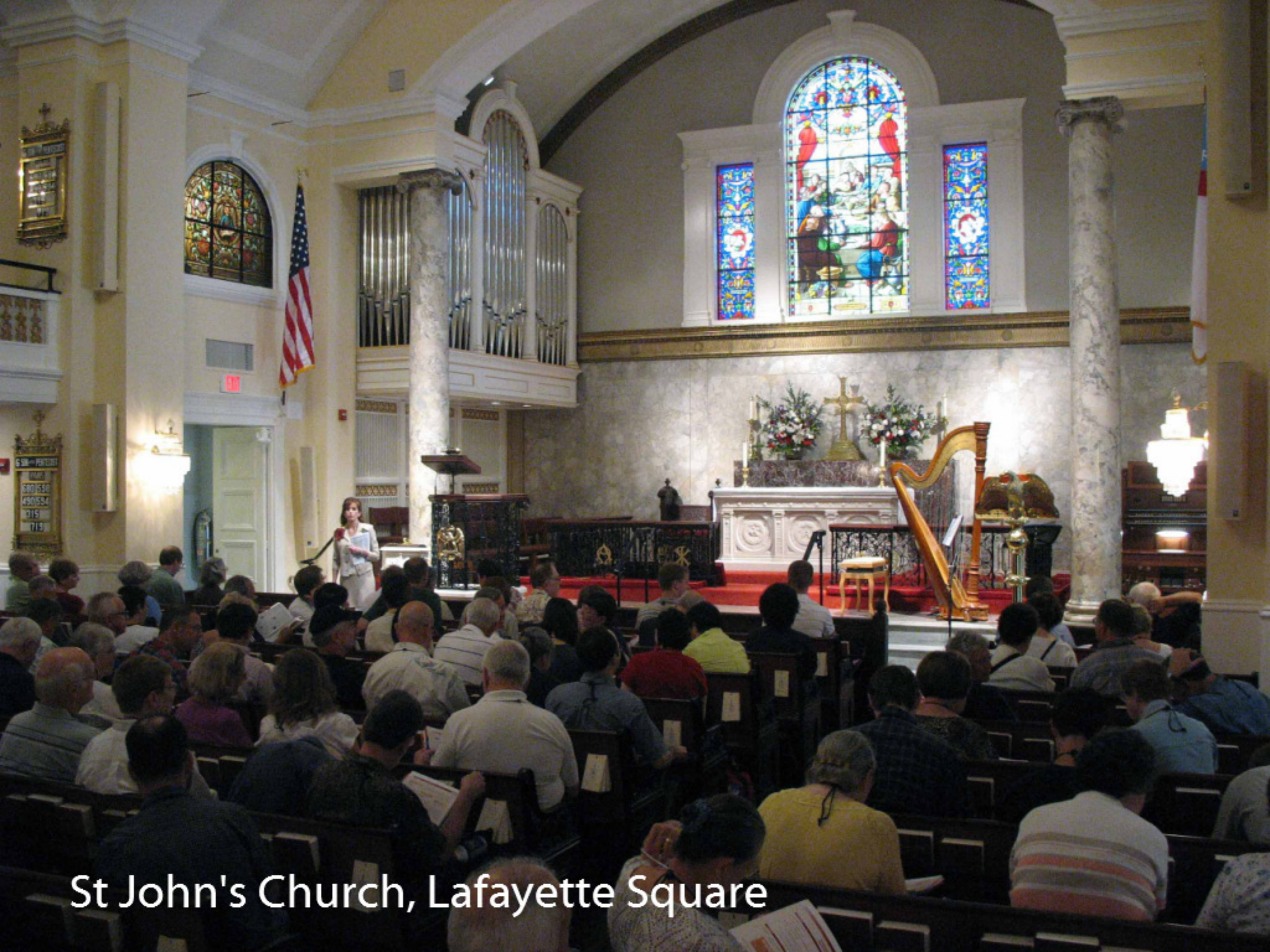
St John's Church, Lafayette Square